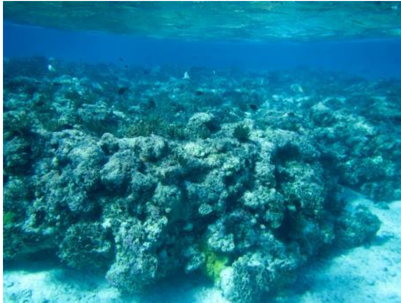
Figure 3 Shallow lagoon behind the barrier reef on the windward side